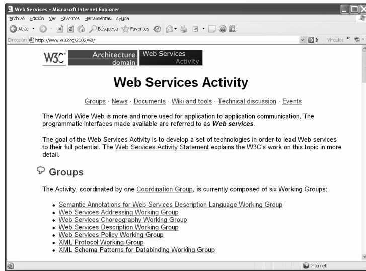
Fig. 1. Web Page of W3C Web site

In Fig. 1 we can see the webpage associated to the URI www.w3.org/2002/ws/ .